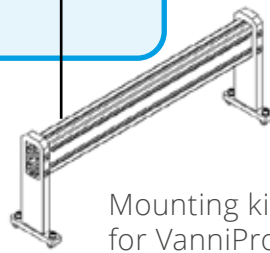
Mounting kit for VanniPro