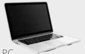
PC • Intel core i7 • 8 GB RAM • 256 GB SSD • Gigabit ethernet