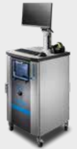
iController • Printer control • UV curing control • Security control • Camera control