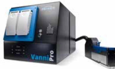
FLUENTE VanniPro print stall • 22 mm print width • 0.7 or 3 meter connection