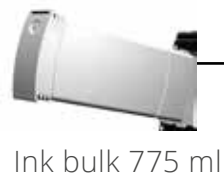
Ink bulk 775 ml