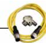
Sensor kit • incl. cable