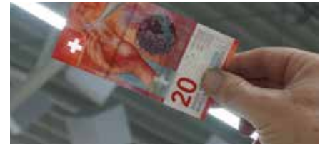
orell füssli introduced the Micro Perforation Feature for the 8th series of Swiss Francs.