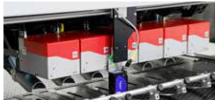
Micro perforation system with 6x 500 Watt CO 2 Laser