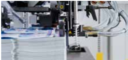
Sheet separation with reliable suction head